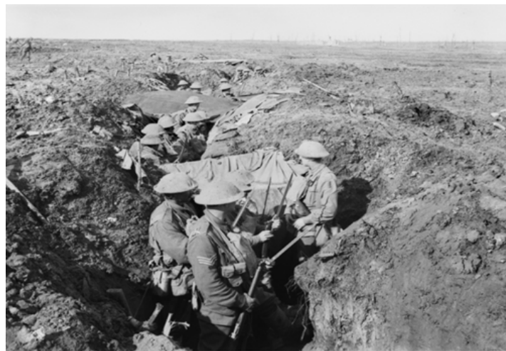
The 30th Battalion in the forward area trenches near Zillebeke, in the Ypres Sector.