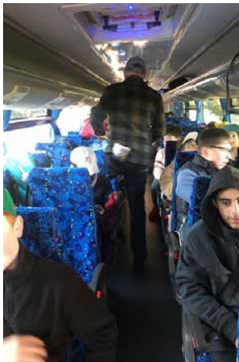
Year 7 camp