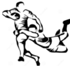
NSW CHS Rugby Union games at our school oval