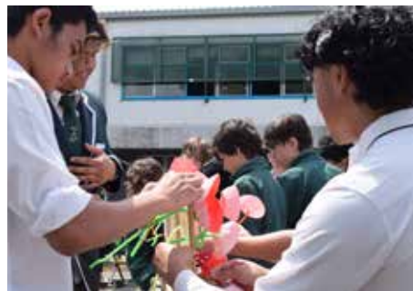
Remembrance Day Assembly