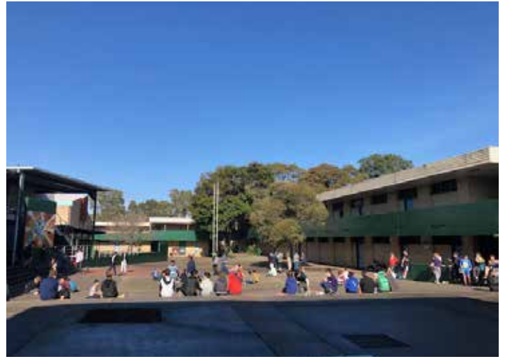
Fitness sessions for our talented athletes at 7am