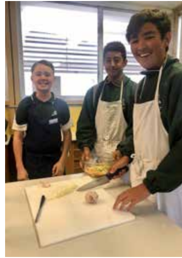
A Kounsai TAS - Computing Teacher

The boys took turns to help use cup-spoons to measure the flour and scoop it into the mixing bowl. They then cut butter in 80g portions to mix with the flour in addition to 150g of milk. They then used a butter knife to mix the dough until it was all mixed. The dough was then rolled out into 2cm thickness, using a rolling pin, and cut into shape, using a cookie cutter mould. The scones were then baked in a pre-heated oven for about 15 minutes.