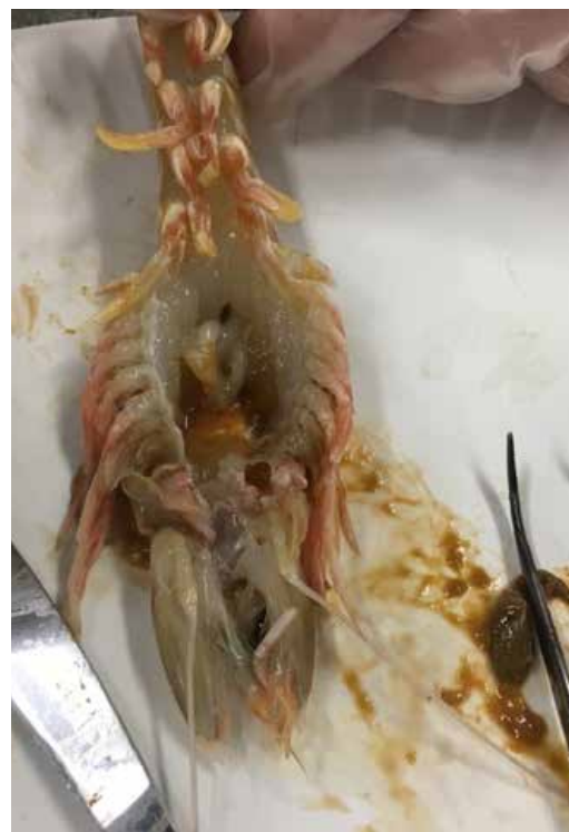
Year 10 Marine farming dissection