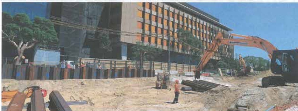
Construction workers install temporary sheet piles to allow work to commence on upgraded stormwater infrastructure along the Botany Street site frontage