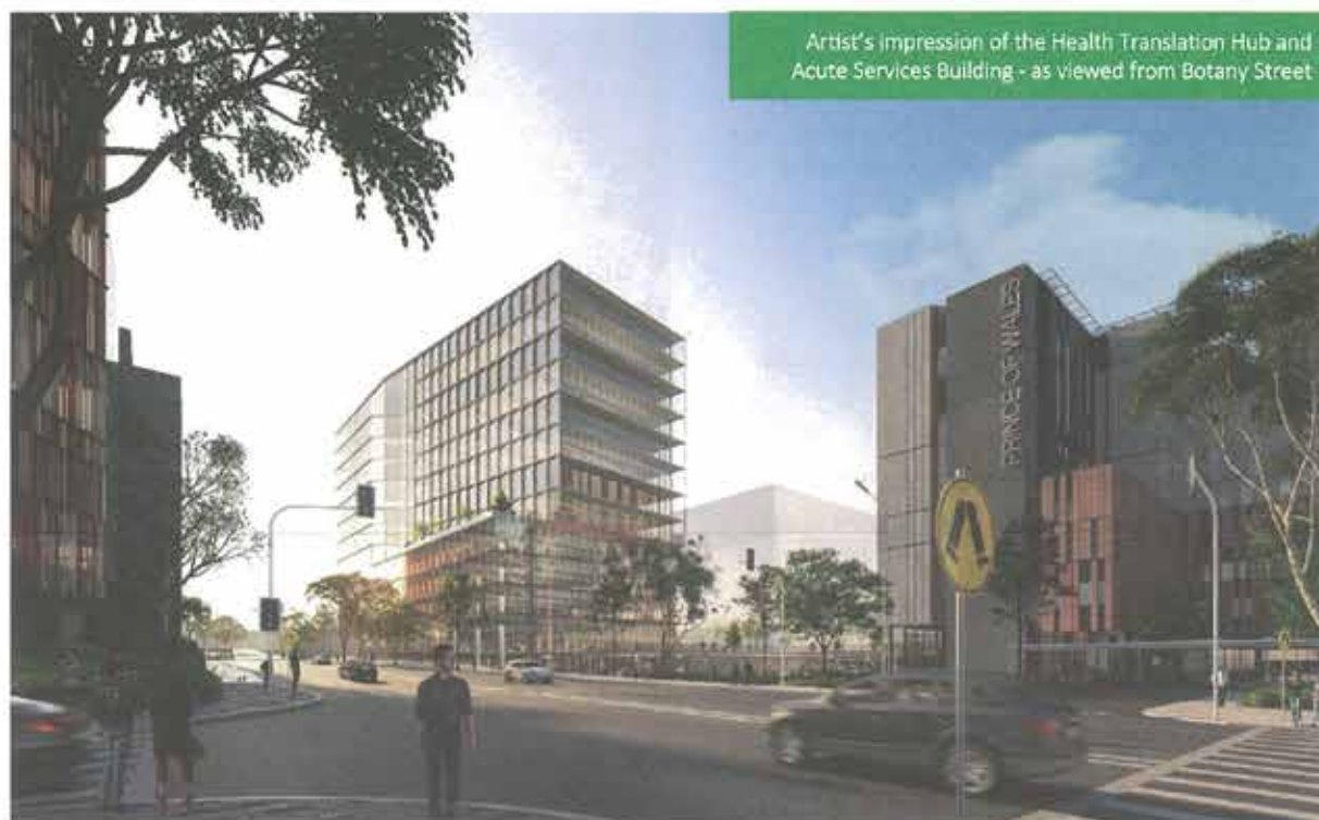
Artist's impression of the Health Translation Hub and Acute Services Building - as viewed from Botany Street

This investment complements the NSW Government's $720 million investment to deliver a new Acute Services Building and strengthen the Randwick Health and Education Precinct.