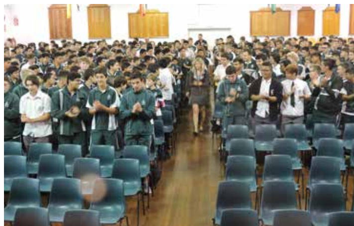
Year 7 clap-in