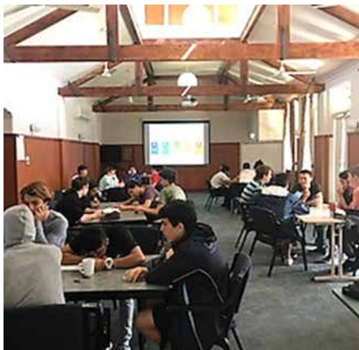
Dr Karl Kruszelnicki presentation